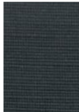
Grigio Antracite 699